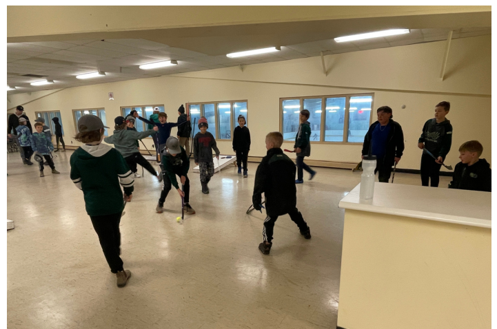
U11's - off ice activities - mini sticks