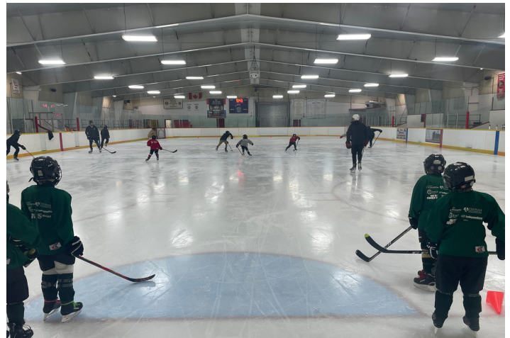
U9's - power skating