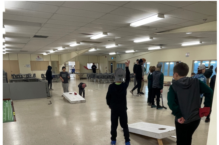
U11's - off ice activities - cornhole